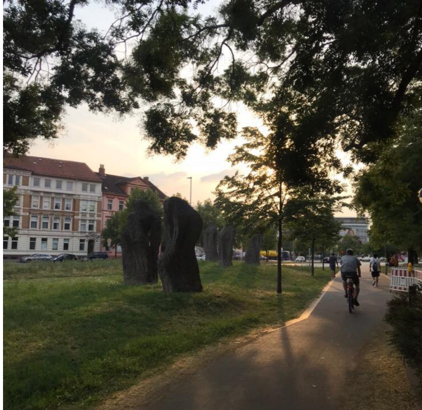
The way to dormitory from the city center

My dormitory situated directly opposite the main campus, where our classes took place. In addition it was modern, clean and pleasant. Private room overlooking the park.