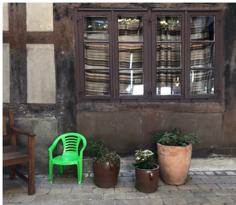
The yard of orphanage