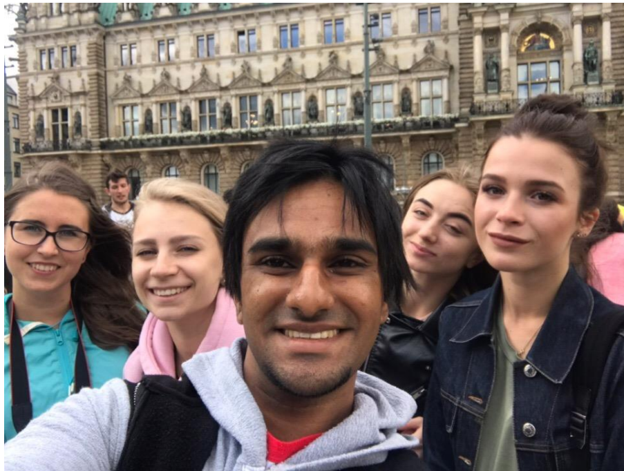
Trip to Hamburg