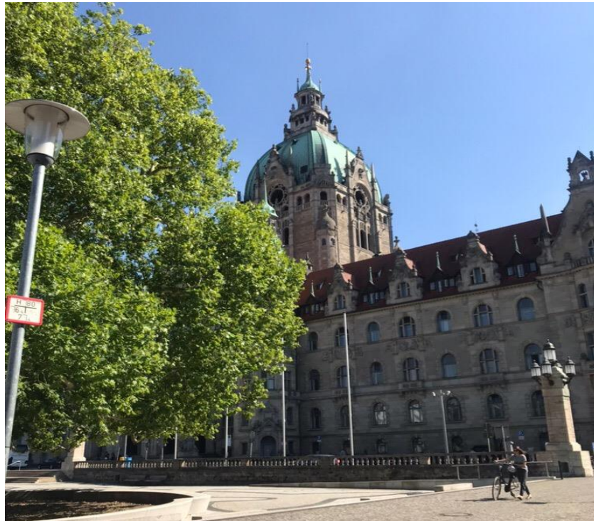
Administration building of Hannover

Getting there was not easy. I remember getting out of the subway with a baggage, it was very warm outside. Everywhere was green and were happy people! The city was much more beautiful than pictures I saw in Google. Old cobbled streets, half-timbered houses and open restaurants. The architecture is very different from the Petersburg, and attracts. Later, I walked around the administration building, Herrenhauser Garten, an old orphanage that is 500 years old and much more interesting buildings.