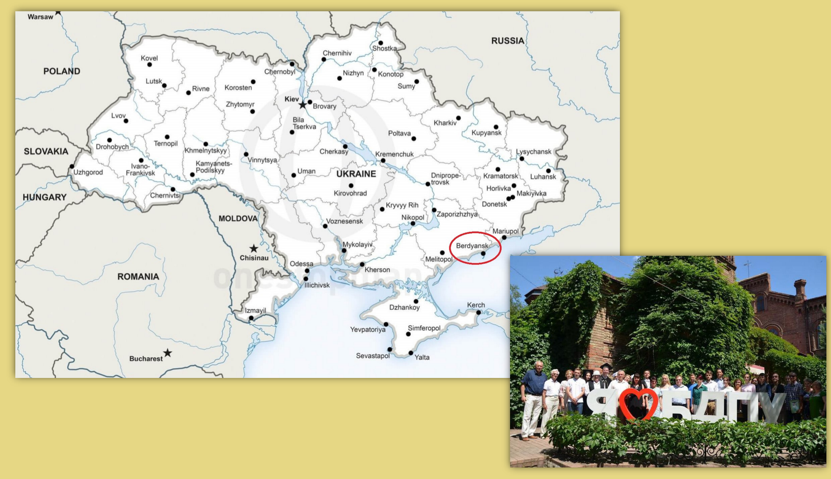
Berdyansk State Pedagogical University on the map of Ukraine

Berdyansk State Pedagogical University is one of the oldest and most powerful higher educational institutions of South-East of Ukraine (Zaporizhzhya region).