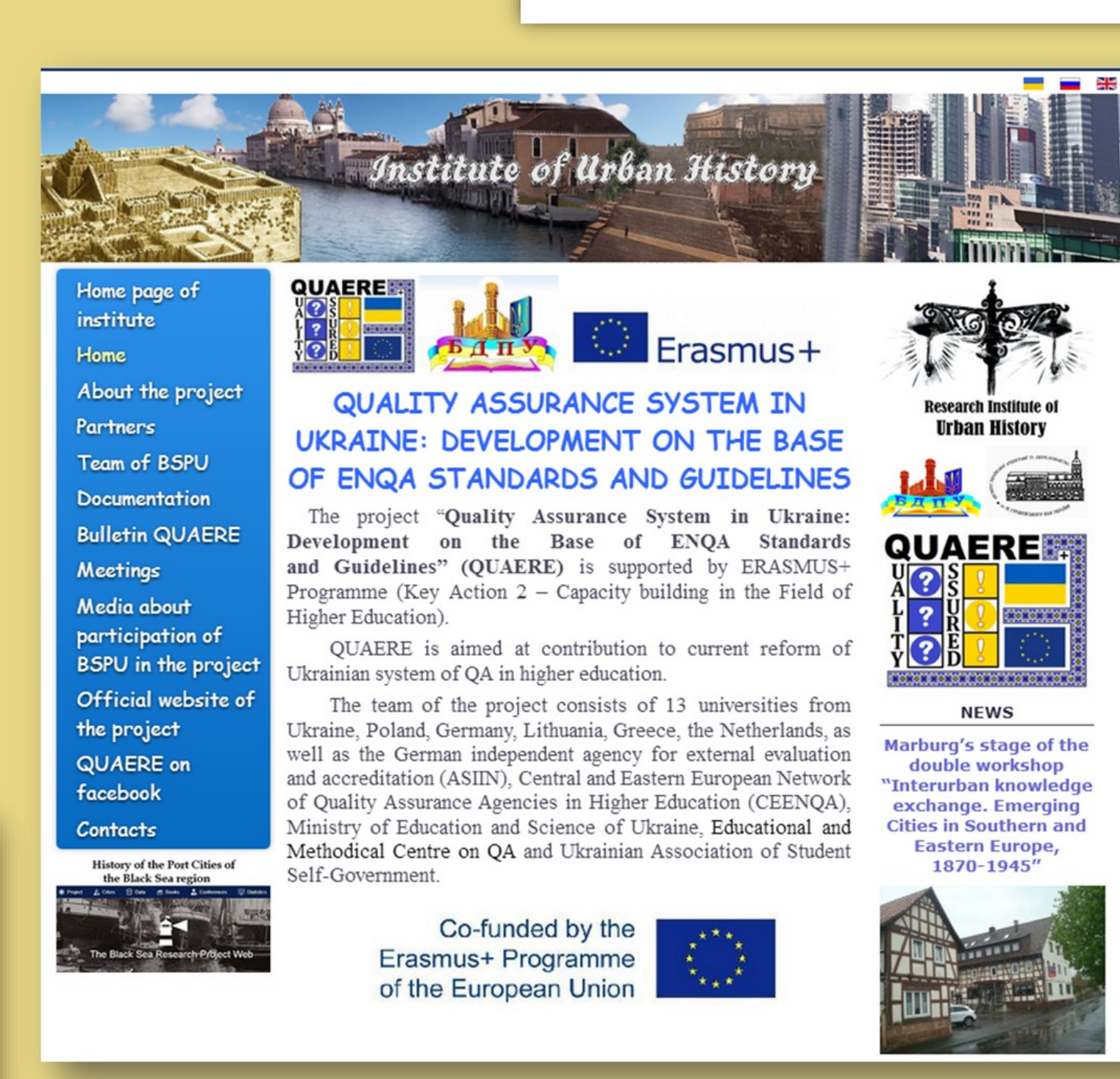
Website of Erasmus+ project (QUAERE)